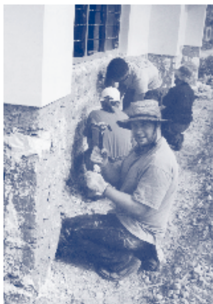
We used innovative techniques to maximize local resources and to effectively work together as an intercultural team.