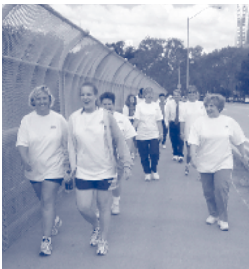
Faculty, staff, and students enjoy participating in the Fitness Bus.

Aaron’s research and writings are multidisciplinary and represent the following fields: physical activity epidemiology, health behaviors in children and adolescents, health of sexual minority populations, and applications of information technology