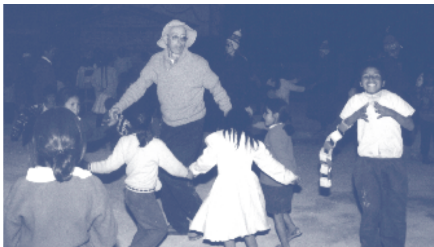
Dancing the night away at the fiesta to celebrate our communal work and the opening of the neighborhood's first fourth- through sixth-grade classrooms.

We worked in the existing school (grades one through three) while sharing photos and books about American children. With help from our group, the Peruvian children also made their own books with digital photos and pictures. We shared these books with American students on our return.