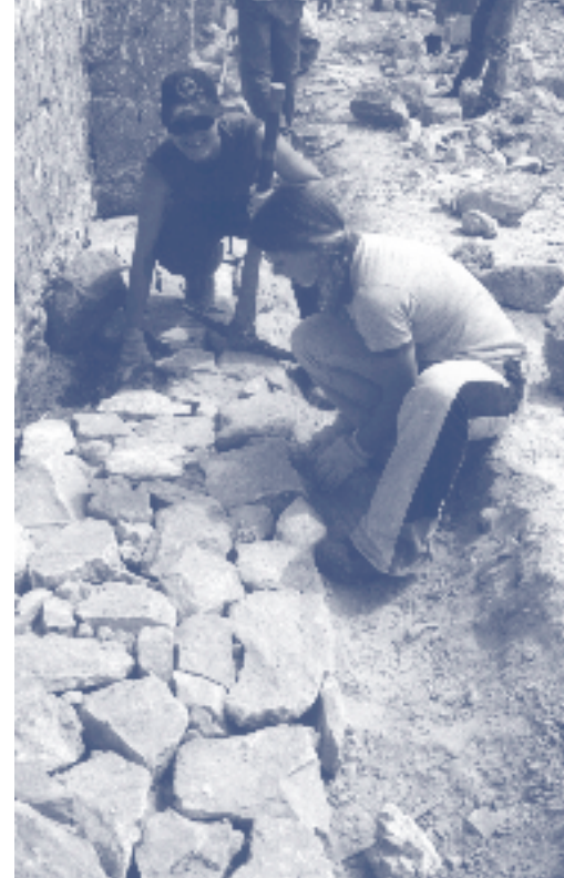
Laying, aligning, and building with rough flagstones required real teamwork.