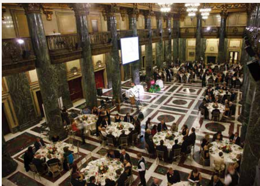
More than 200 faculty, staff, alumni, and friends gathered to celebrate the School of Education's 100th anniversary at Carnegie Music Hall.

When the University of Pittsburgh School of Education was established on February 3, 1910, little did its founders know that during the next 100 years, their creation would result in tens of thousands of teachers, researchers, administrators, educators, and overall difference makers. To honor this 100th anniversary achievement, more than 200 School of Education staff, faculty, alumni, and friends gathered together in April 2011 at Carnegie Music Hall for the Centennial Celebration Gala. The event featured a cocktail reception on the balcony, followed by dinner and the year's alumni awards, and culminated