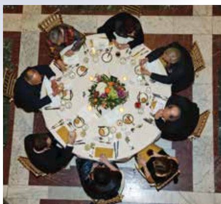
Attendees enjoyed dinner, which was followed by music and dancing.

— E.B. HUEY, ONE OF THE SCHOOL OF EDUCATION'S FOUNDERS