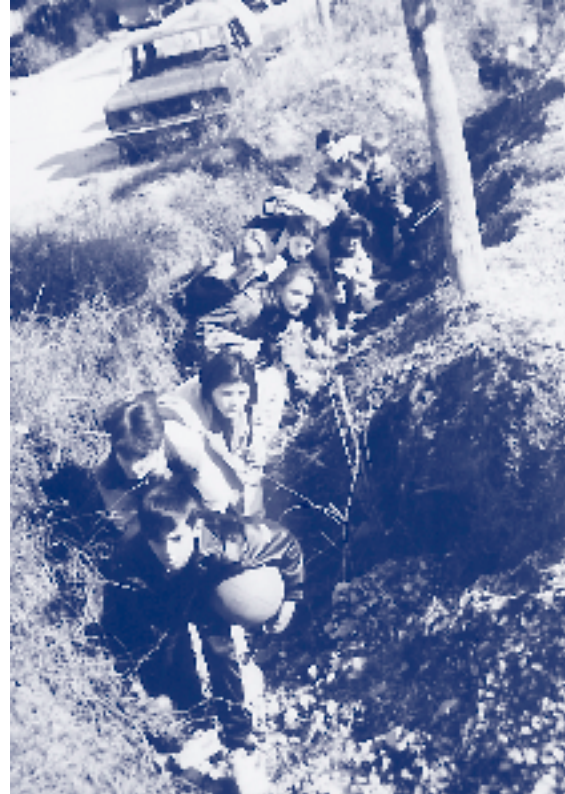
A group of elementary school children move through the trench lines of Dobrinja en route to class.